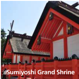
Sumiyoshi Grand Shrine