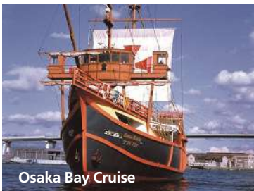
Osaka Bay Cruise