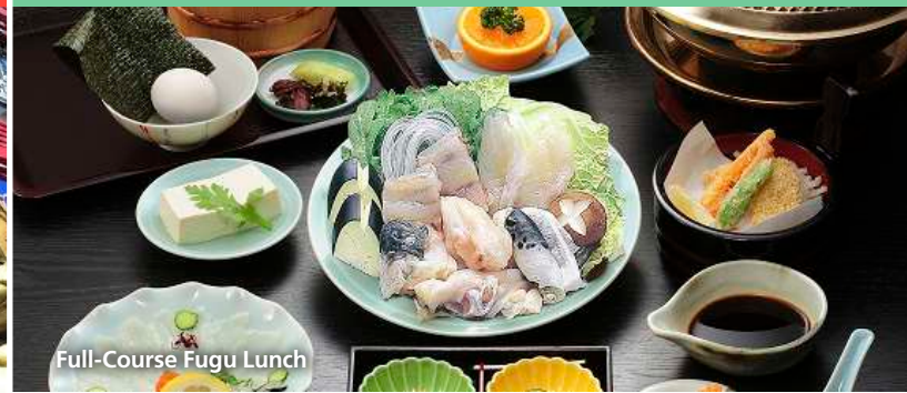
Full-Course Fugu Lunch