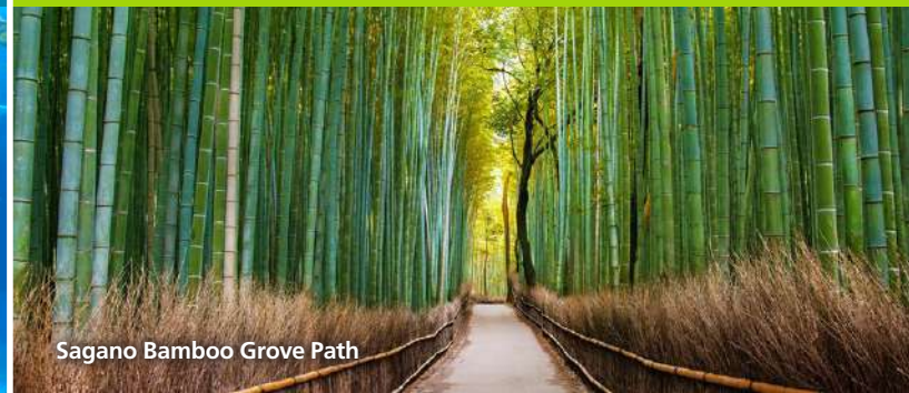
Sagano Bamboo Grove Path